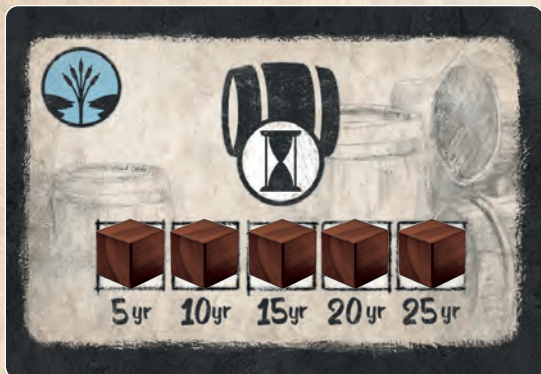
A new barrel with 5 cubes.

They must place 5 new cubes on the barrel to show that it is full. Later in the game, these cubes will be removed to show that the barrel is aging.