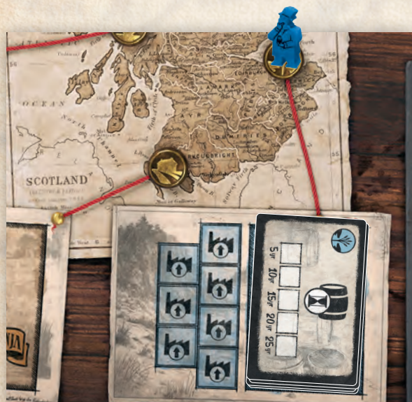
New cards are placed face down.

After the card has been removed, whether it was purchased or discarded, the player must place the matching distillery card from their hand onto the board. This card is placed face down.