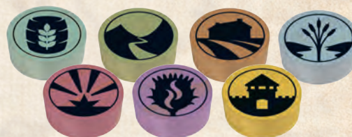
Distillery Markers, 3 each

8 Determine turn order by arranging the player pawns on the turn order track randomly.